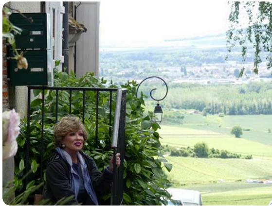
A small village near Reims France.