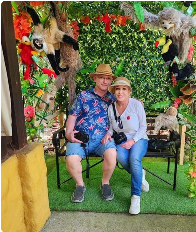
Rest stop in Costa Rica February 2023