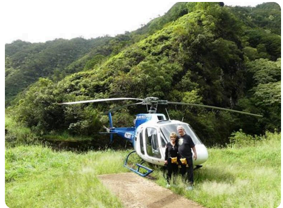
Our trip to Jurassic Falls in Hawaii