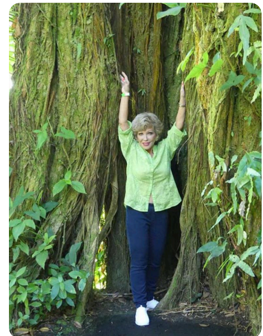
At the botanical gardens in Hilo Hawaii.