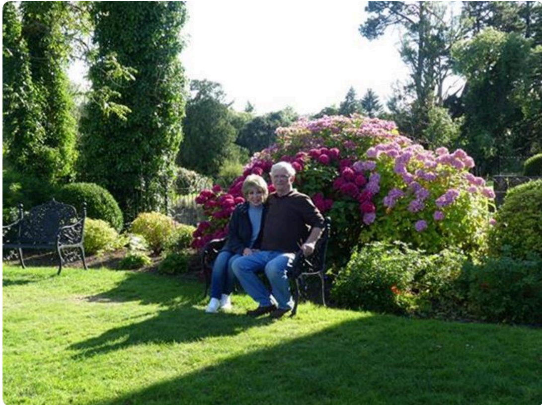
In the gardens of the castle we stayed in in Ireland

I loved her broadcasts on HSN, & now I'm so disgusted WHY HSN had fired her...because of an illness she couldn't control? WAIT until one of you CEO's have an auto-immune disease or other that may impair working ability. Then you'll understand.Well, EBay, here I come!!