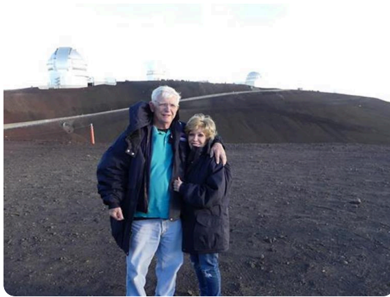
On top of Mouna Kae in Hawaii