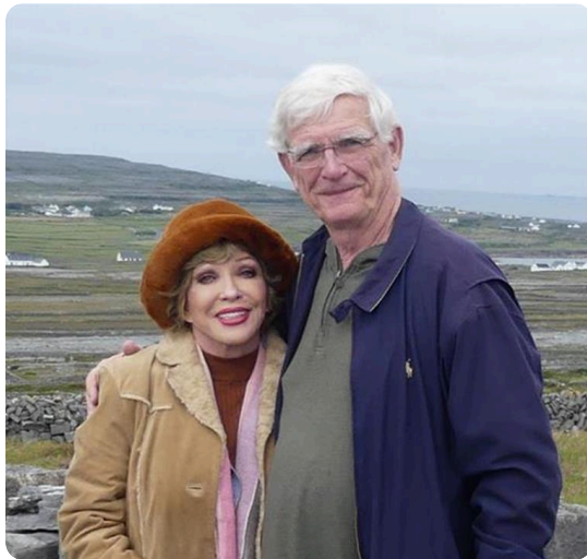
On the Aran Islands off the coast of Ireland.