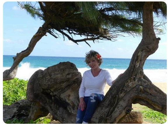
Our last day on Kauai Hawaii