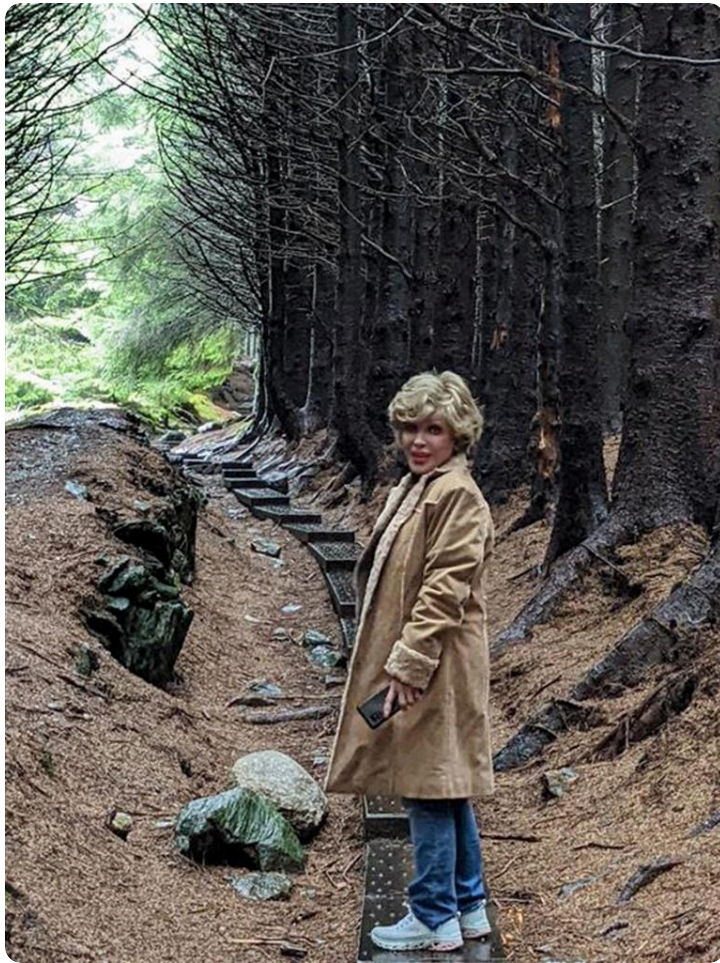
On a misty morning in Ireland, walking through the woods. She could have walked there forever.