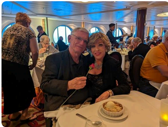
Valentines dinner 2023 on the cruise to Columbia