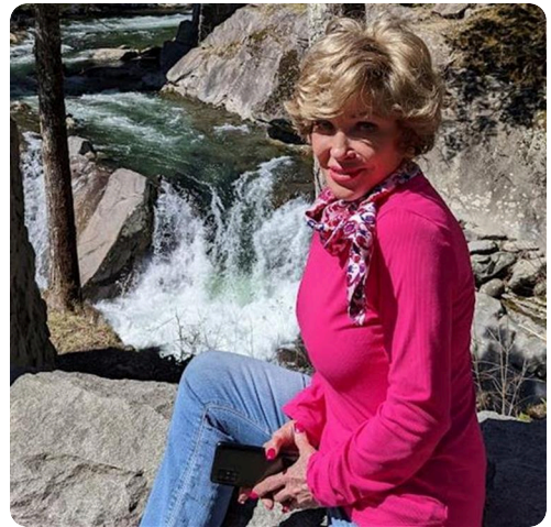
In the Smokey Mountains March 2022. Her first trip to Knoxville