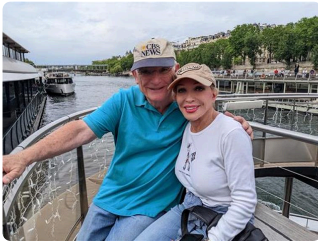
River Cruise in Paris